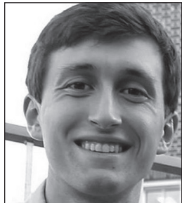
HOWELL, FOCUS MISSIONARY

Jesus chose MSU for me! But I'm very excited to bring Him to New Jersey.