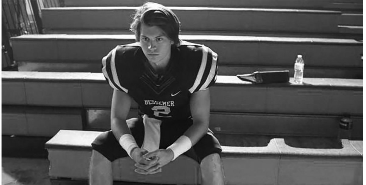
Run the Race

“Each one of you has to be God’s microphone. Each one of you has to be a messenger, a prophet.” St. Oscar Romero”