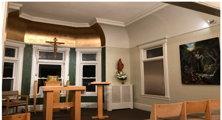
View of the Chapel, February 2019, with the painting "Christ the True Friend" on the right of the altar

Looking at our own sacred space, I had wanted to find something that would do the same. Something that would lift our minds and hearts; it would speak to those who find it and would find Newman Catholic their spiritual home during their time at Montclair State. For years I looked at catalogs of mass-produced icons, statues, murals, prints... and nothing felt right. People had suggested different Saints or "Blessed's" (those who, God willing, will one day be canonized Saints, including our name-sake, John Henry Newman). But the more I talked about that with students, the more I found the list growing: "How about St. John Paul II or St. Mother Teresa?" -