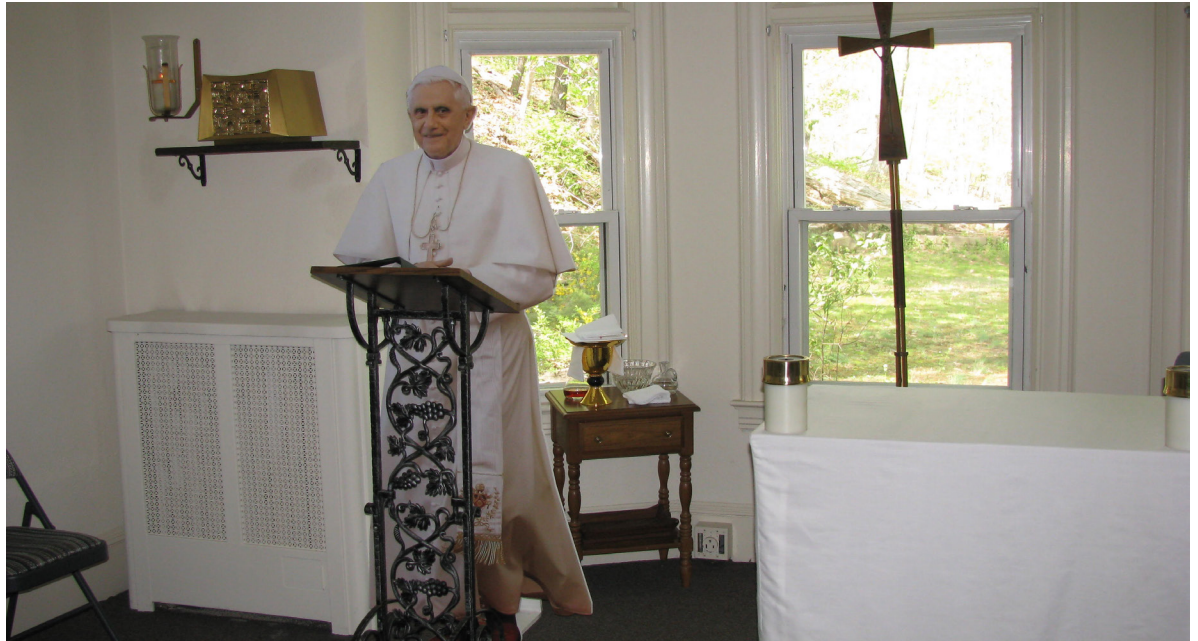
Our chapel in April 2008, with a "Special visitor."

“To be a Christian means to forgive the inexcusable because God has forgiven the inexcusable in you.” - C.S. Lewis